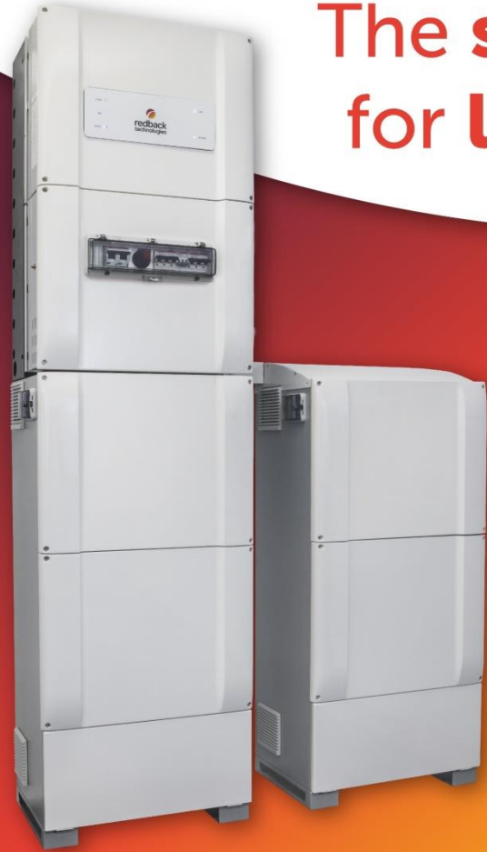
The Redback Smart 3-Phase Hybrid System